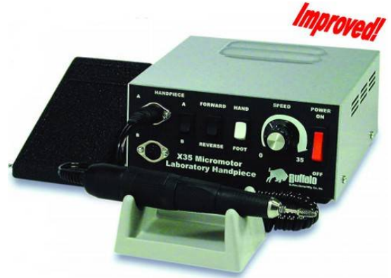
See description - Replacement Console ONLY